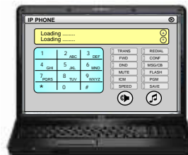
Wireless Connectivity Through

User Friendly Maintenance : On line PC Admin • DB up / download • Software upgrade • Off Line PC Admin