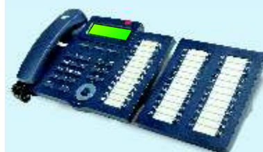
48 Key DSS Console for LDP7224D & LDP7208D