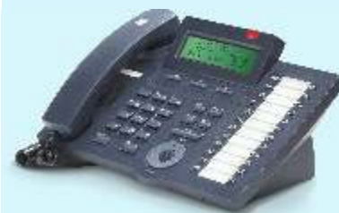
Key Phone: LDP7224D