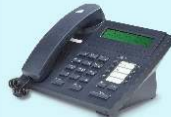
Key Phone : 7208