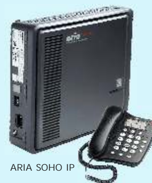
ARIA SOHO IP