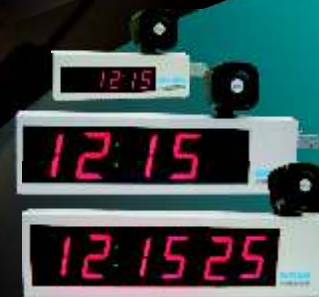
MULTI RANGE OF DIGITAL DISPLAY