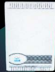
SL-ALFA (Wall Mountable)